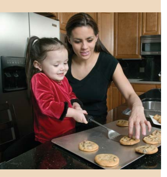
Even without medical exams, you still get a great premium rate!

We've made buying affordable term life insurance