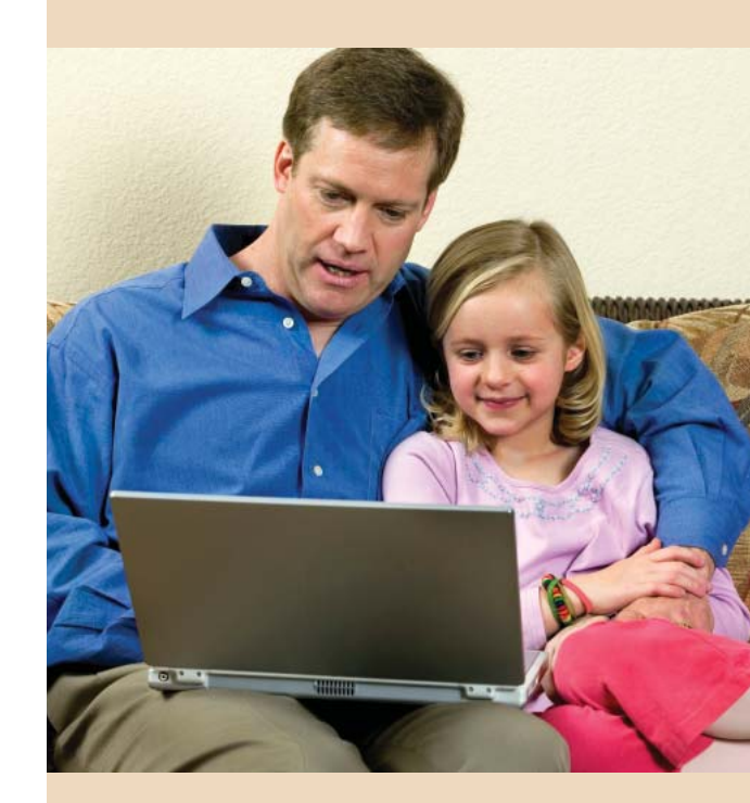
Protect your entire family with the Other Insured Rider and Children's Term Rider.