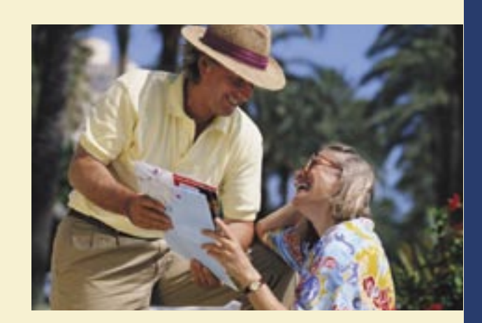
United Home Life Insurance Company

United Home Life Insurance is offering a Term Life Insurance Portfolio that helps solve this dilemma. The Express Issue Term Plus, Express Issue Term 30, Premier 20, and Premier 30 Term Life Insurance has been designed with value and convenience in mind. This means it can be easier than ever to purchase the coverage necessary to address many, if not all your needs. Plus, by adding the benefits available with these policies, you can tailor a plan that caters to your specific situation.